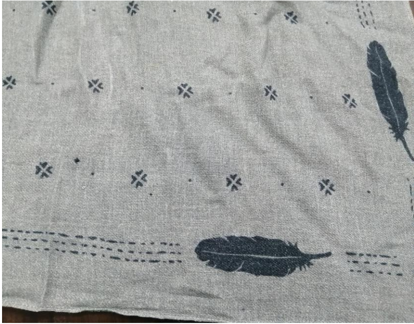
90% COTTON + 10% CASHMERE – FRONT SIDE