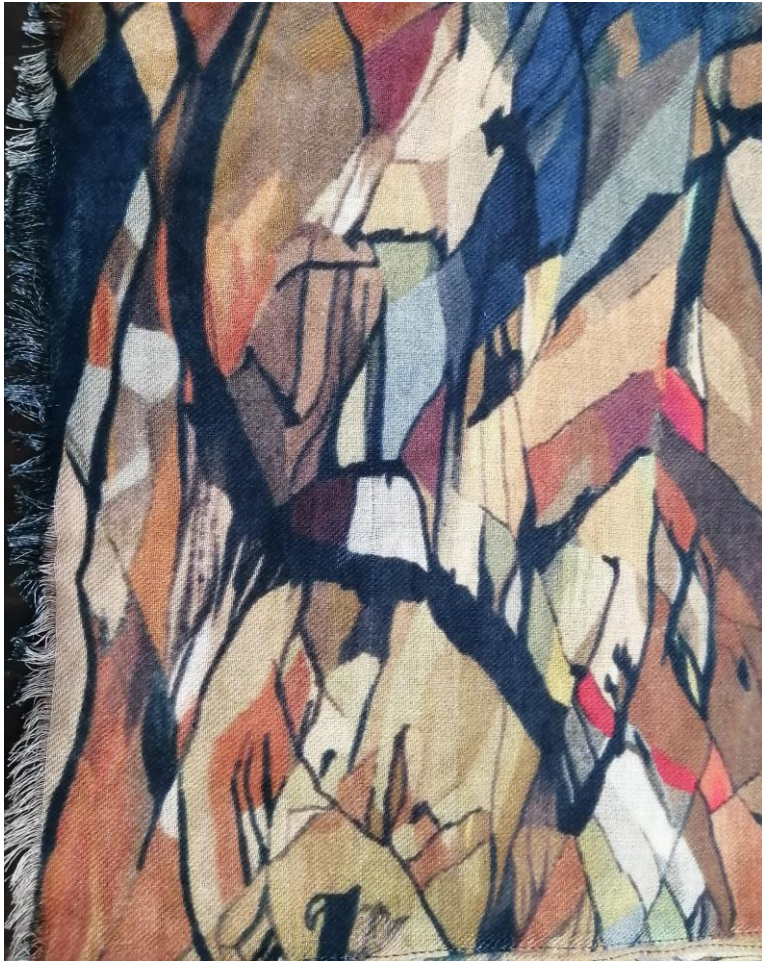
50% COTTON + 50% LYOCELL – FRONT SIDE