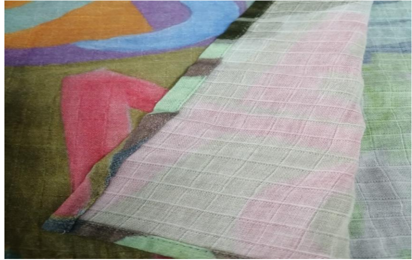
COTTON MUSLIN - BACK SIDE