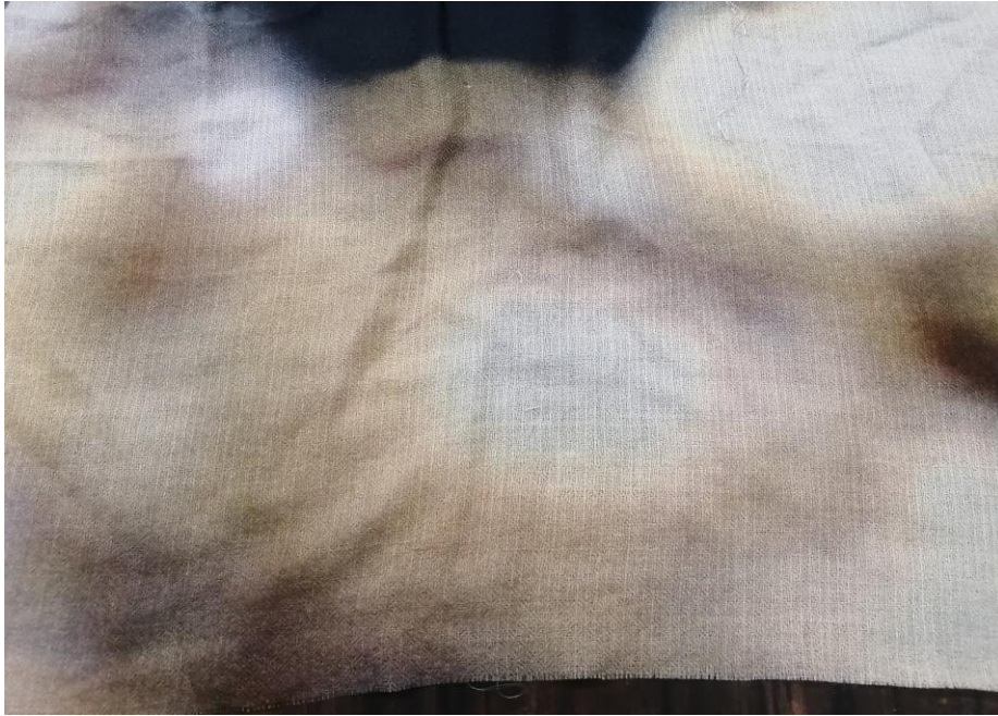
100% CASHMERE – FRONT SIDE