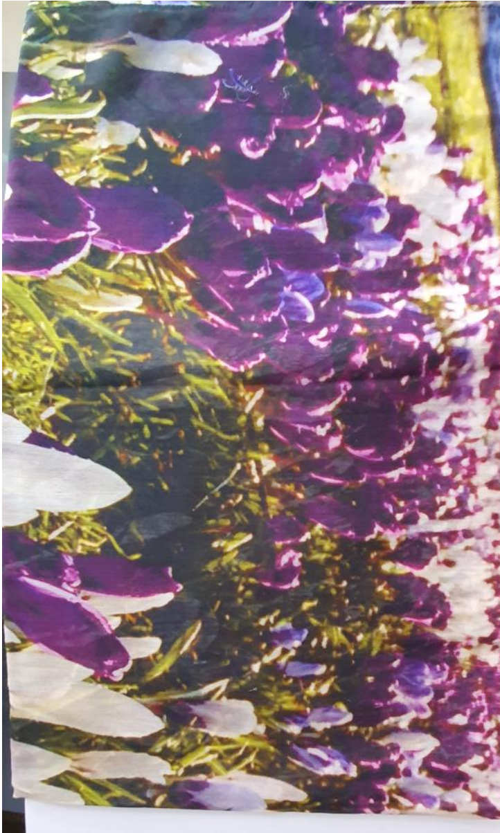
75% COTTON + 25% SILK FRONT SIDE