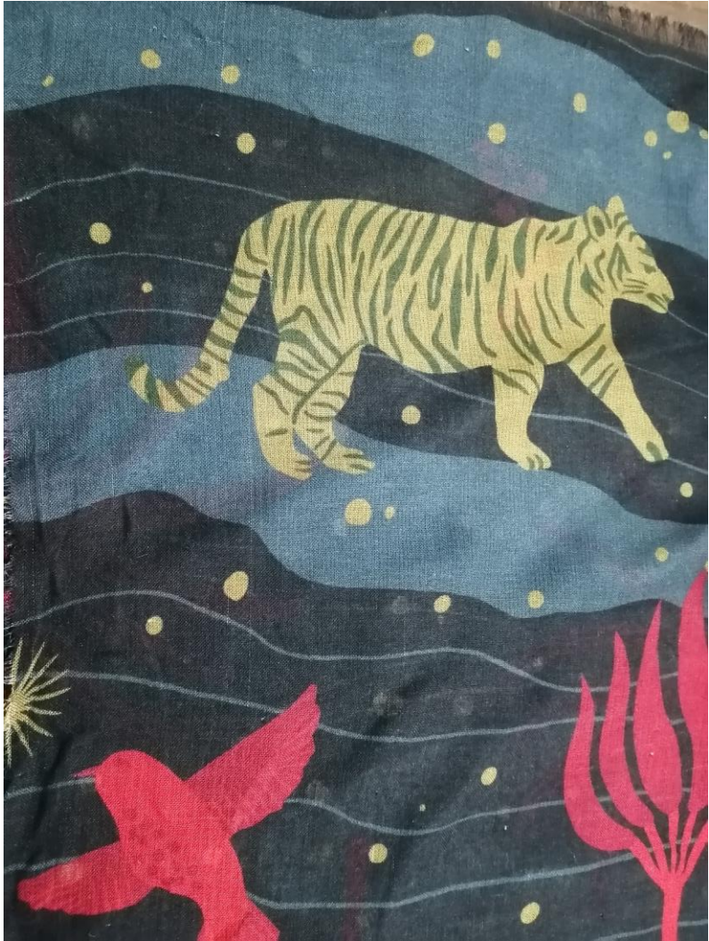
93% MODAL + 7% SILK – FRONT SIDE