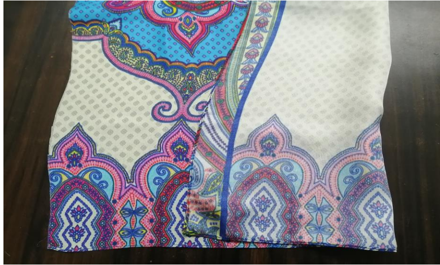
100% LIGHT SILK - BACK SIDE