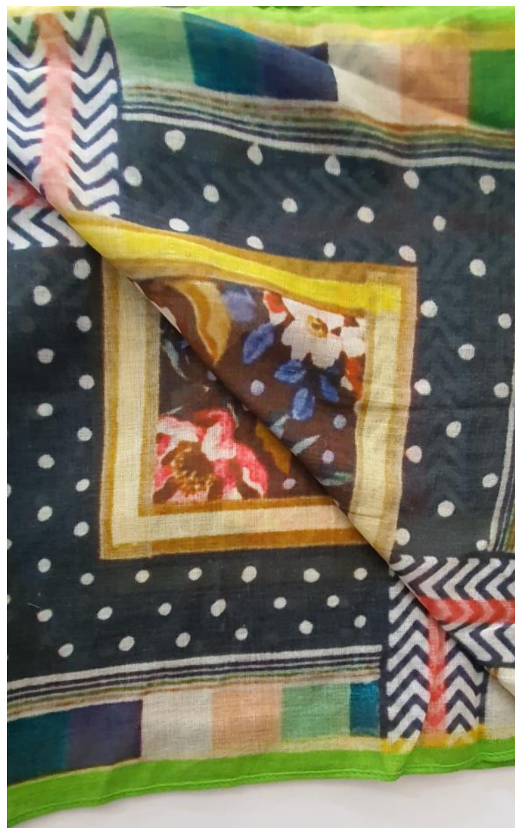
100% ORGANIC COTTON – GOTS CERTIFIED BACK SIDE