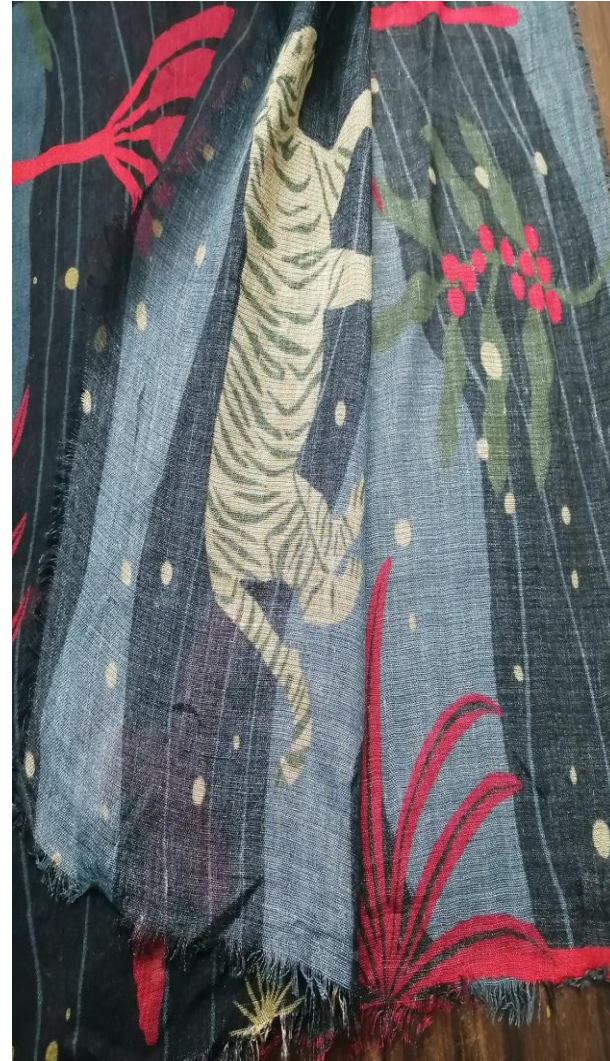
93% MODAL + 7% SILK – BACK SIDE