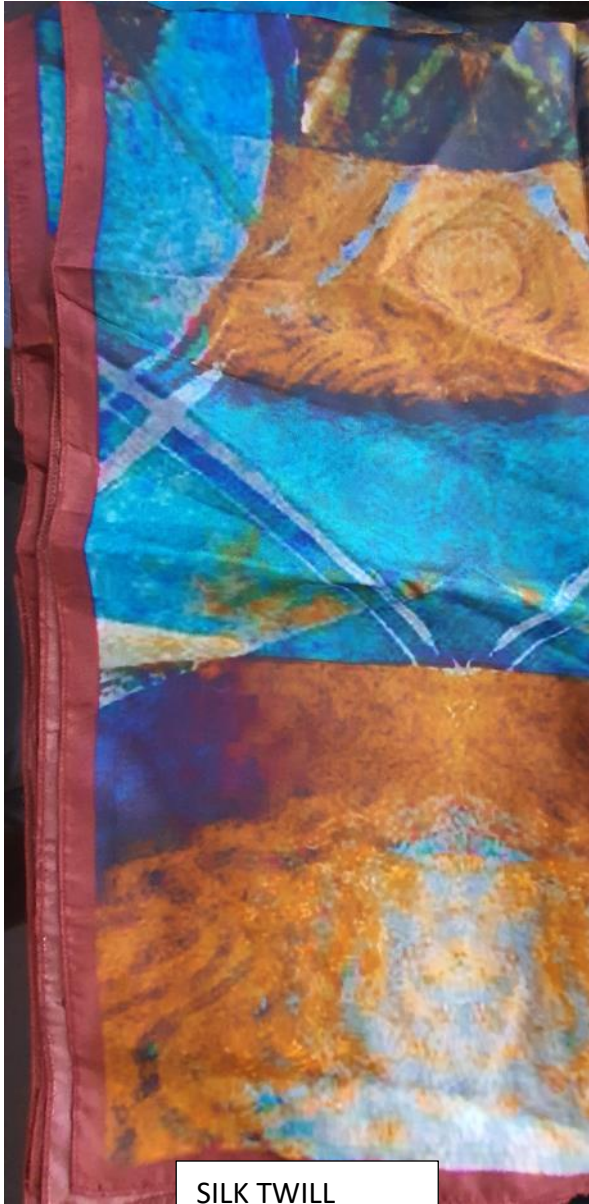
SILK TWILL FRONT SIDE