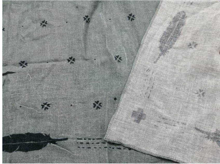
90% COTTON + 10% CASHMERE – BACK SIDE