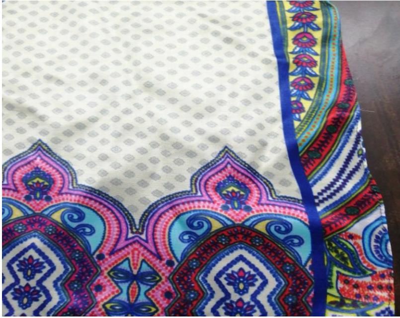
60% BEMBERG + 40% MODAL - FRONT SIDE