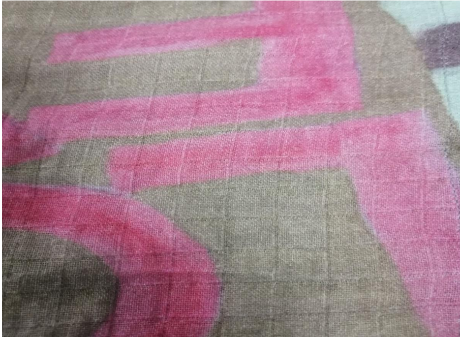
COTTON MUSLIN - FRONT SIDE