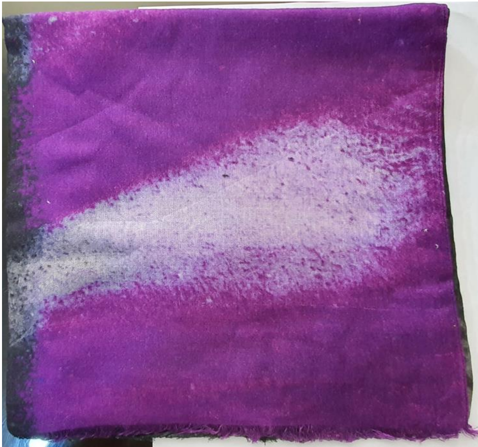
90% MODAL + 10% CASHMERE FRONT SIDE