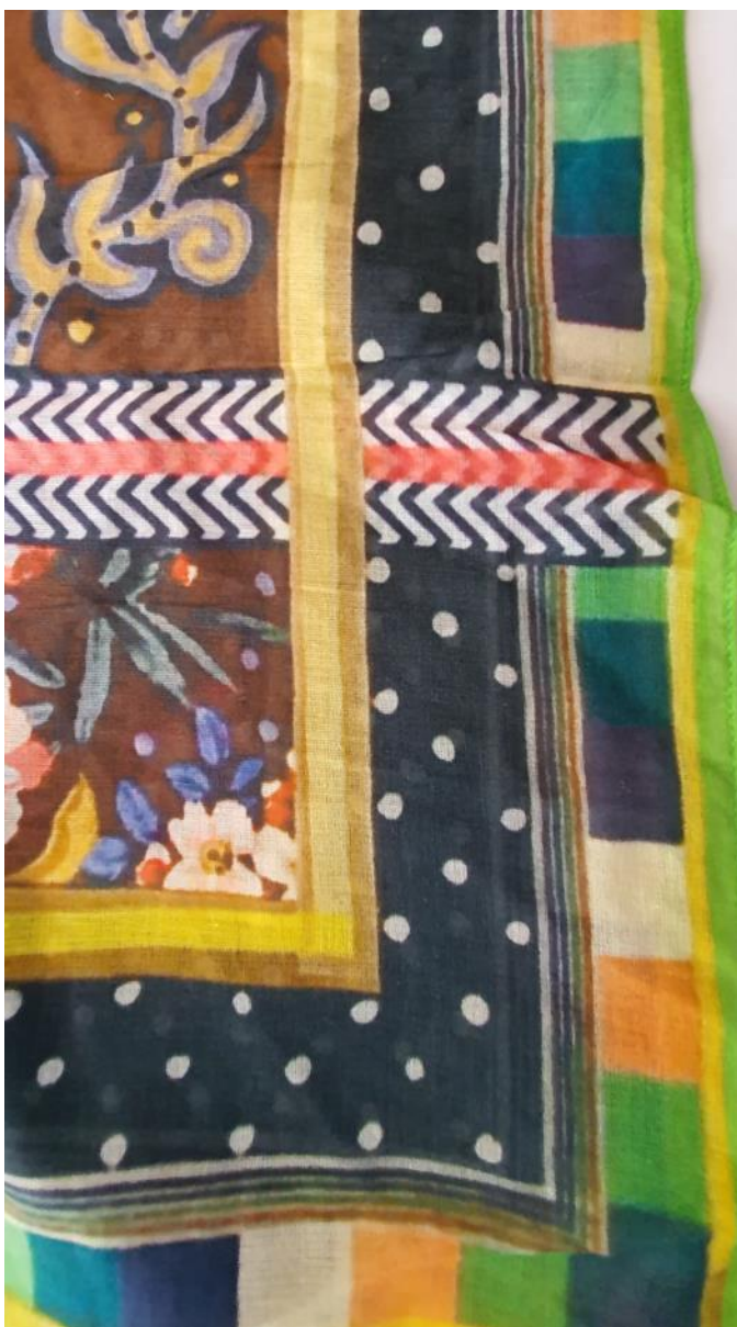
100% ORGANIC COTTON – GOTS CERTIFIED FRONT SIDE