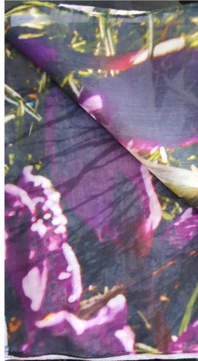
75% COTTON + 25% SILK BACK SIDE