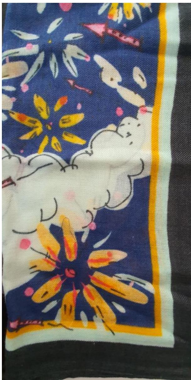
90% WOOL + 10% SILK FRONT SIDE