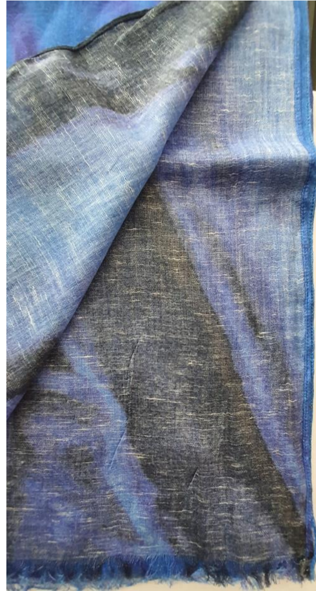
60% COTTON+20% LINEN+20% MODAL BACK SIDE