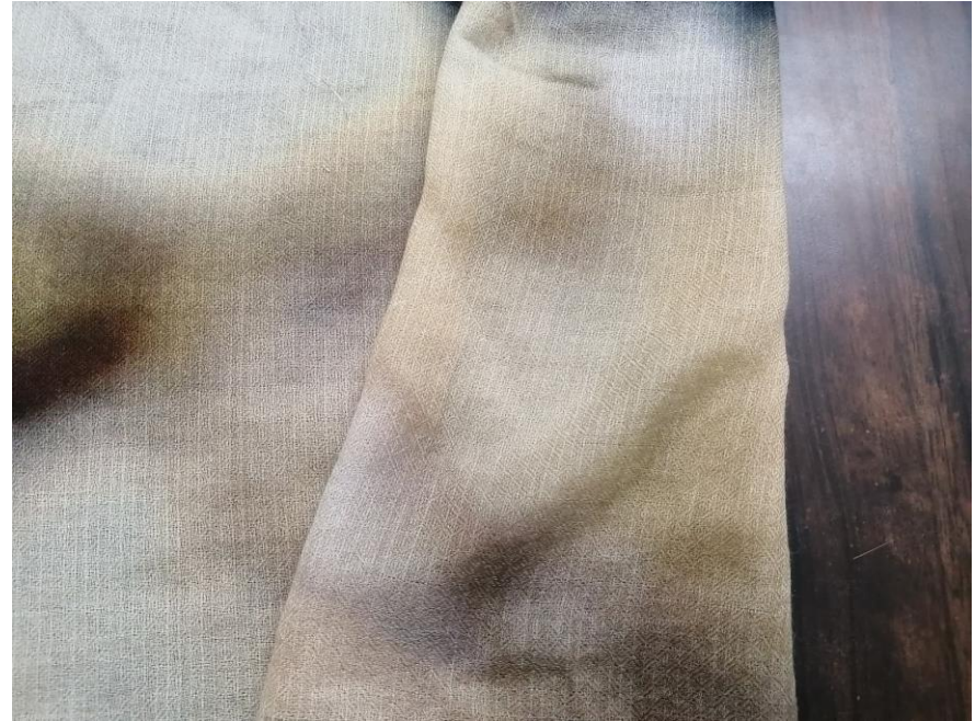
100% CASHMERE – BACK SIDE