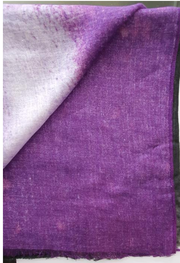
90% MODAL + 10% CASHMERE BACK SIDE