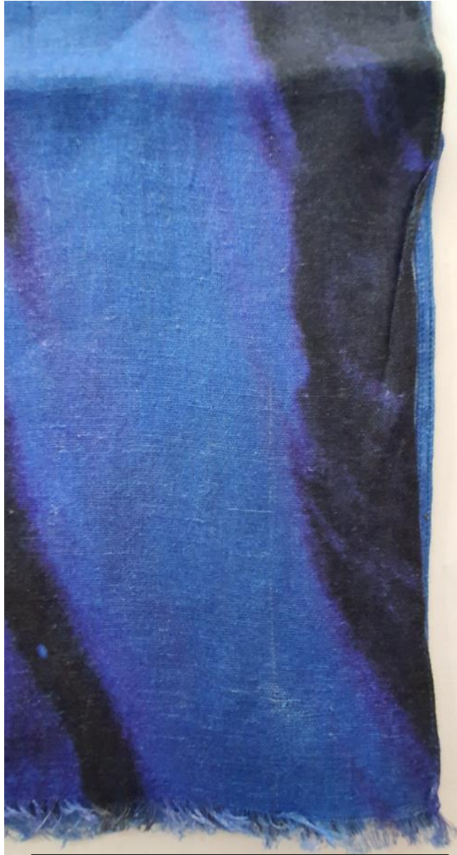
60% COTTON+20% LINEN+20% MODAL FRONT SIDE