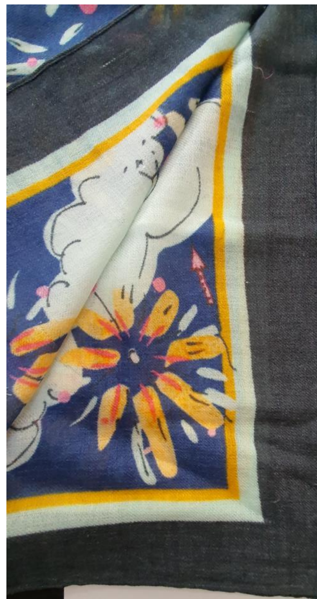
90% WOOL + 10% SILK BACK SIDE