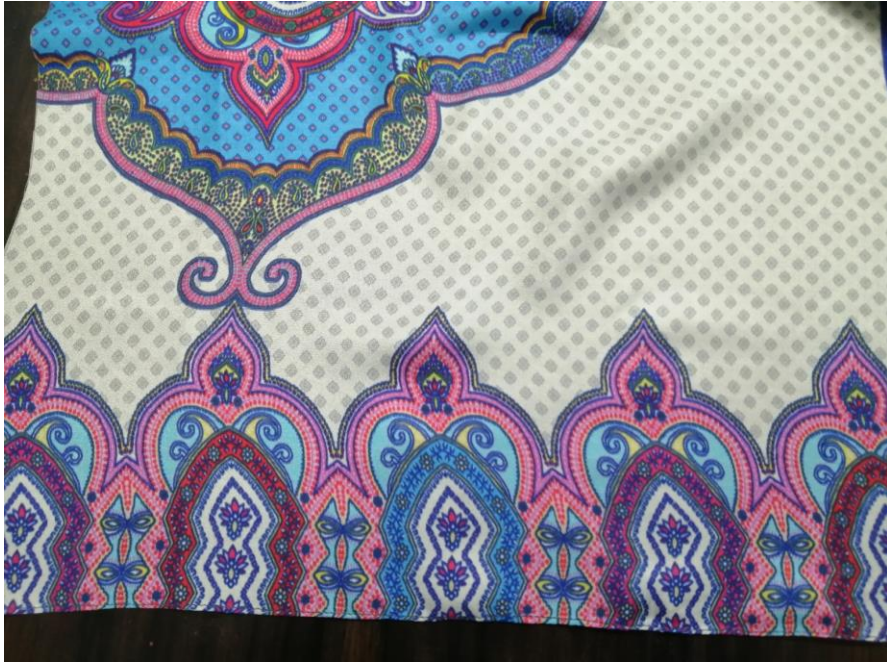
100% LIGHT SILK - FRONT SIDE