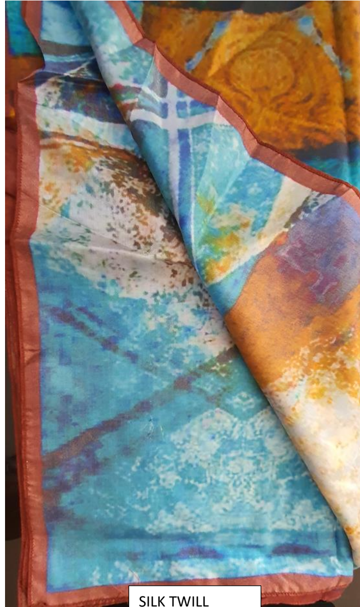
SILK TWILL BACK SIDE