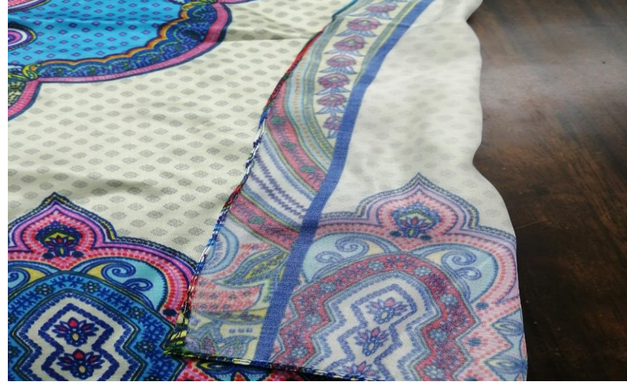
60% BEMBERG + 40% MODAL - BACK SIDE